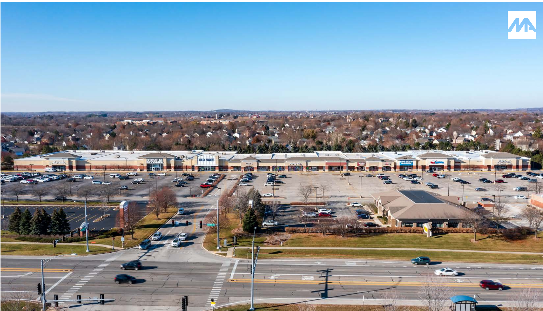
RANDALL SQUARE - SW VIEW